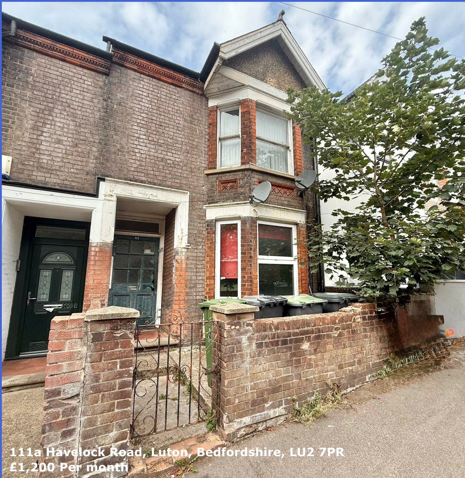
111a Havelock Road, Luton, Bedfordshire, LU2 7PR £1,200 Per month